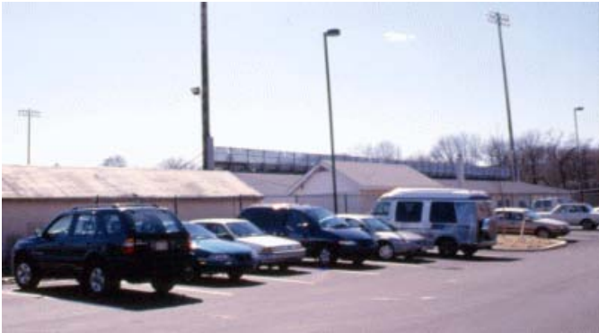
Grigg Athletic Field, behind Pottstown Middle School