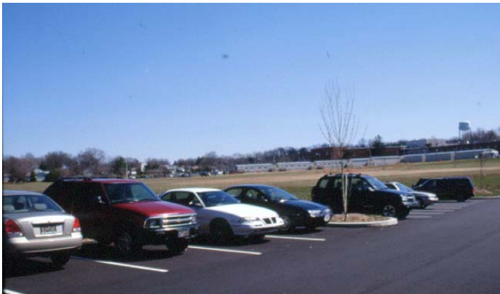
Pottstown Middle School parking lot