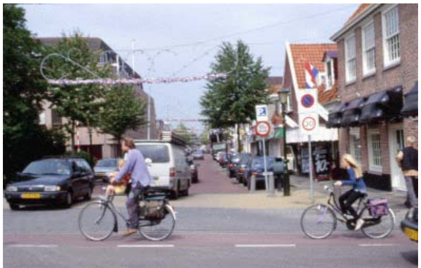
One third of all trips in Holland are taken by bicycle.