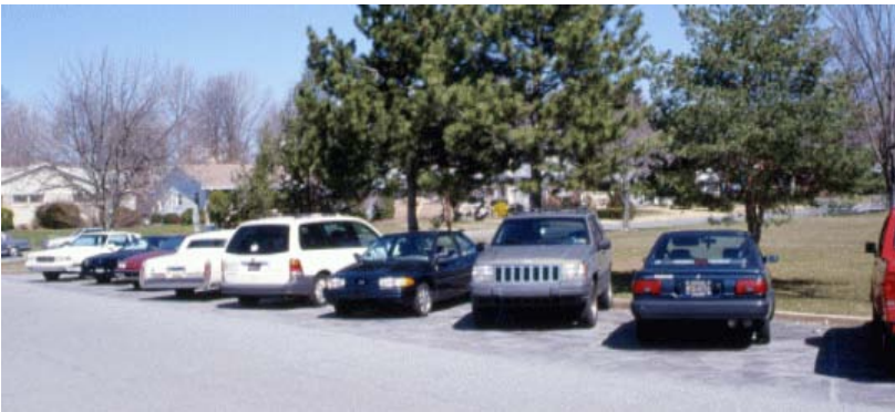
Left and below, Pottstown High School parking lot